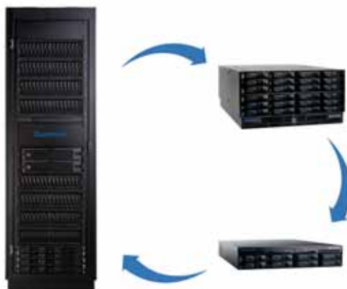
DXi-Series replication uses existing WANs for DR protection, linking backup data across sites and reducing or eliminating media handling

The DXi-Series disk backup solutions leverage data de-duplication technology to increase disk capacities 10 to 50 times and replicate data between sites over existing WANs. The DXi Series spans the widest range of backup capacity points in the industry, from 1.2TB to 240TB of raw disk capacity. All models share a common software layer, including de-duplication and remote replication, allowing IT departments to connect all their sites in a comprehensive data protection strategy that boosts backup performance, reduces or eliminates media handling, and centralises disaster recovery operations. The DXi3500 and DXi5500 are easy-to-use disk backup appliances for distributed offices and midrange data centres. The DXi7500 offers enterprise performance and capacity, along with direct tape creation, policy-based de-duplication, and a high availability architecture. All DXi solutions offer simultaneous NAS and VTL interfaces—and all are supported by Quantum, the leading global specialist in backup, recovery, and archive.